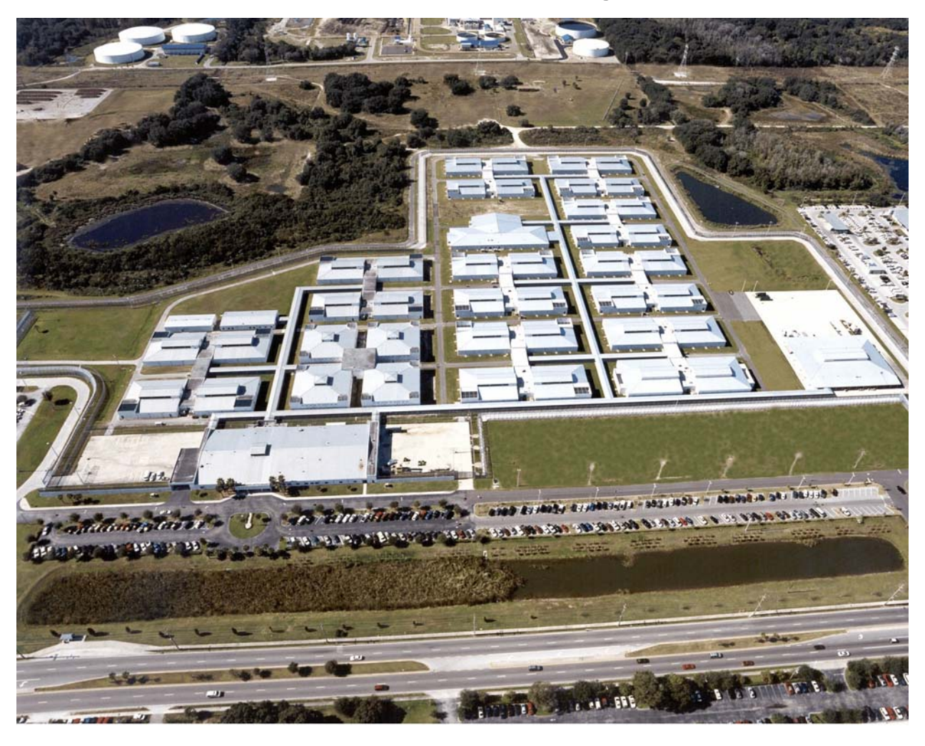
Exhibit 1. Aerial View of the Falkenburg Road Site

The Falkenburg Road site is composed of eight general population housing units, each with four 64-bed dormitories and four 64-bed, single-cell confinement units. The site also has two 50-bed infirmaries, inmate programs building, administration building, and storage areas. All custody levels of pretrial and sentenced inmates are housed at the facility.