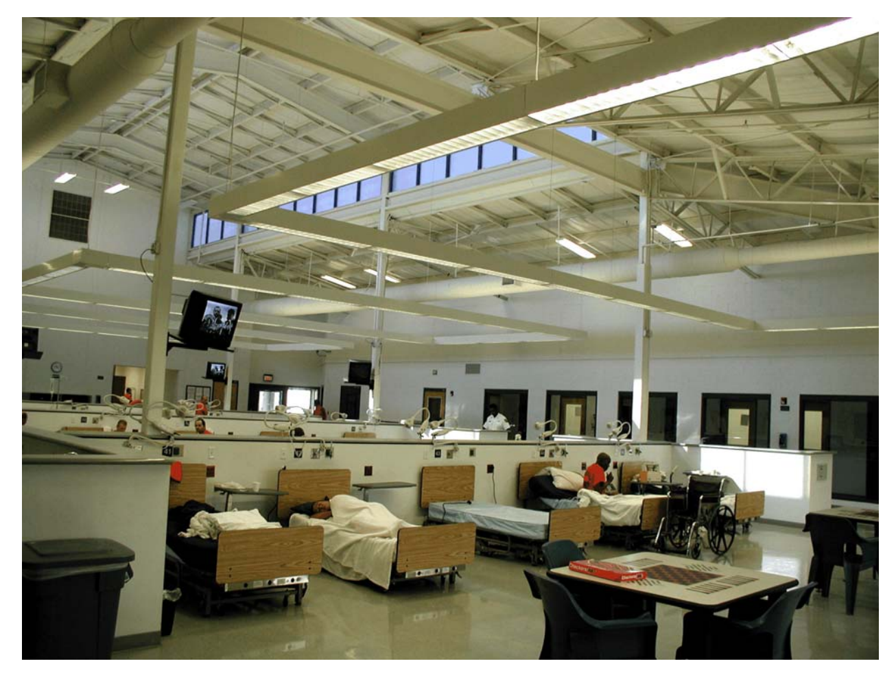
Exhibit 5. The Falkenburg Road Jail Infirmary

The design of the infirmary provides an open room partitioned with four-foot high walls. Down the right wall of the infirmary, partially visible in this picture, are ten single-bed rooms having negative air-flow for inmates with contagious, air-borne diseases. There are also ten single-bed rooms along the left side of the unit for other classification considerations.