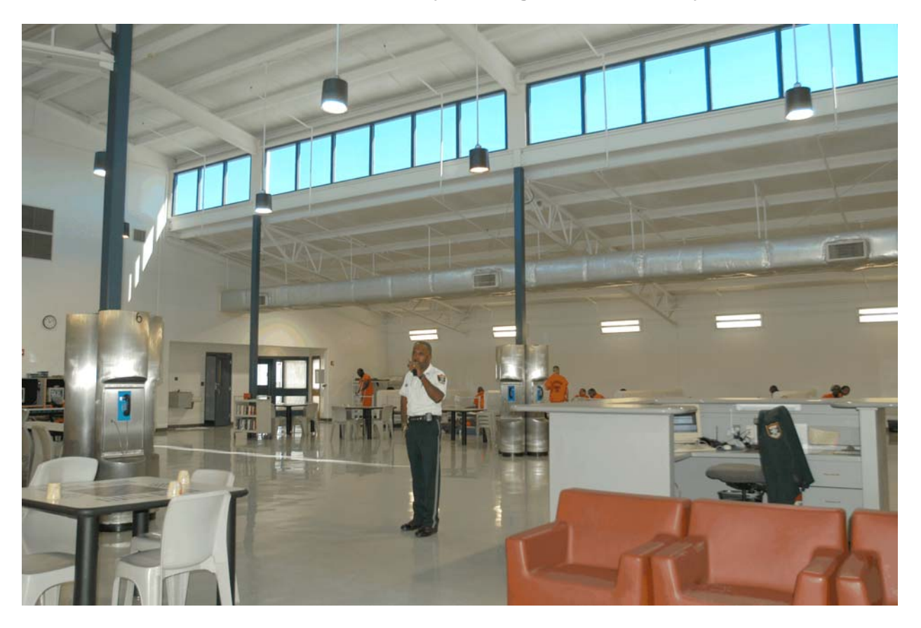
Exhibit 2. View of a Dormitory Looking Toward the Entry Door

Exhibit 2 shows the openness of the dormitory and ease of observation within the unit.