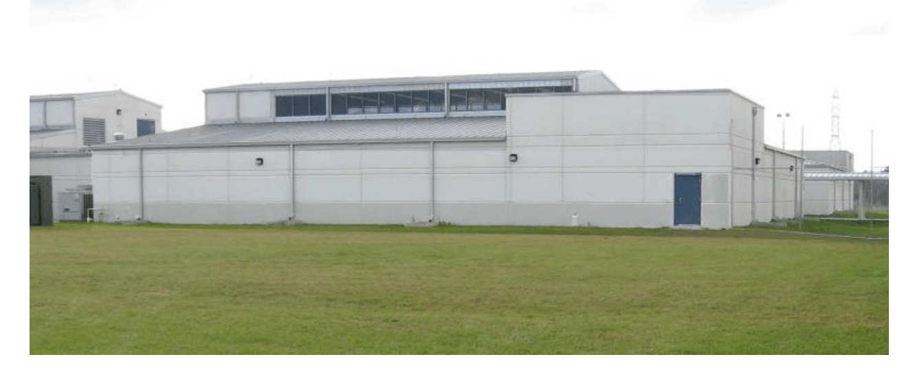
Exhibit 6. Exterior View of a Dormitory Unit

Construction costs are reduced by using precast walls. The initial Falkenburg Road dormitories had walls that were cast on-site. However, quality control could not be uniformly maintained and some bubbling of exterior surfaces was found. Now the walls are cast off-site under more rigidly controlled conditions and trucked-in. This form of construction is also faster. The outside appearance of a dormitory is shown below.